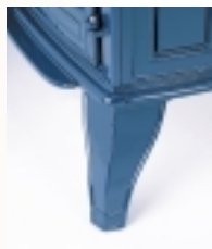
Gracefully sculptured legs complete the classic look