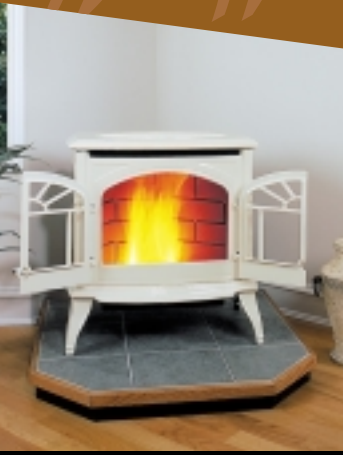
The Antique White porcelain enamel cast iron freestanding Windsor features opening cast iron doors