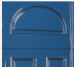
Cast side panels feature classical details