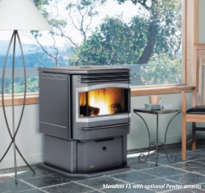
Meridian FS with optional Pewter accents

Traditional looks are combined with modern styling, laser cut heavy gauge steel and state-of-the-art heating technology.