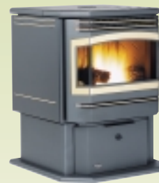
Meridian FS with optional 24kt gold accents

Traditional looks are combined with modern styling, laser cut heavy gauge steel and state-of-the-art heating technology.