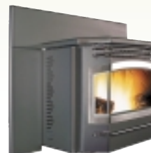
Meridian FPI with optional pewter accents