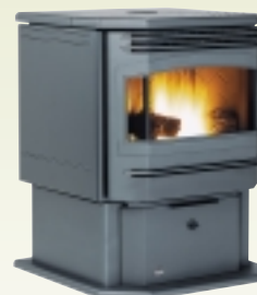
Meridian FS with standard painted accents