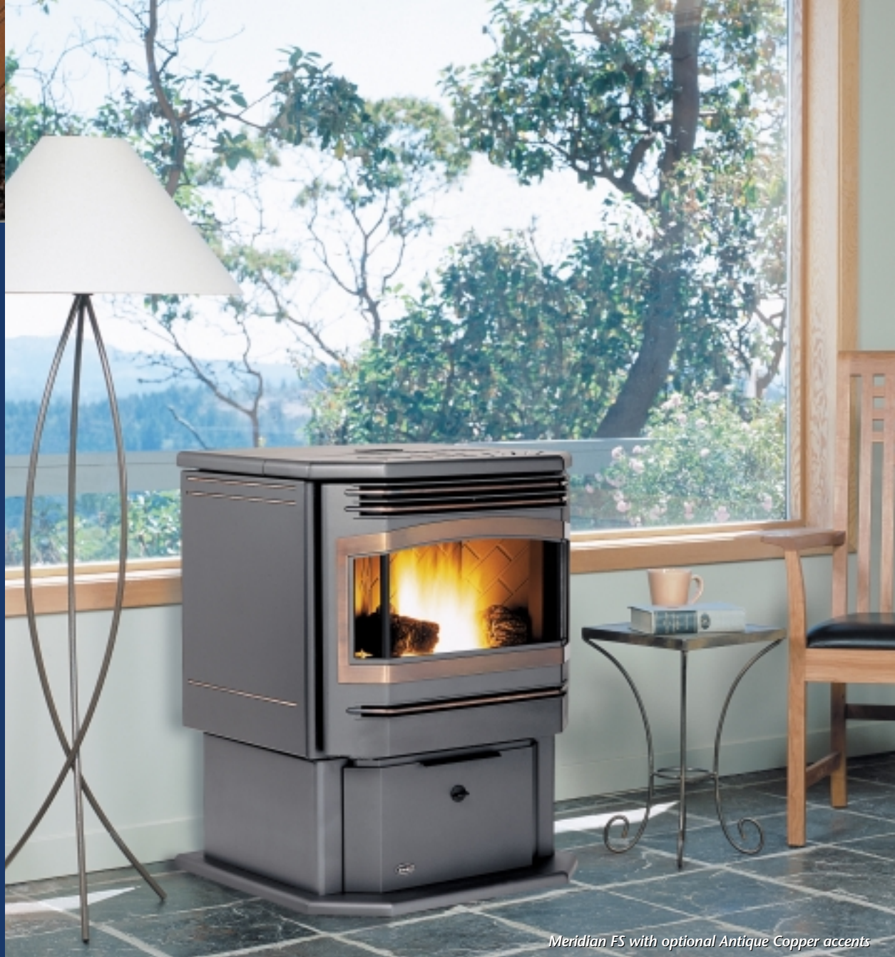
Meridian FS with optional Antique Copper accents